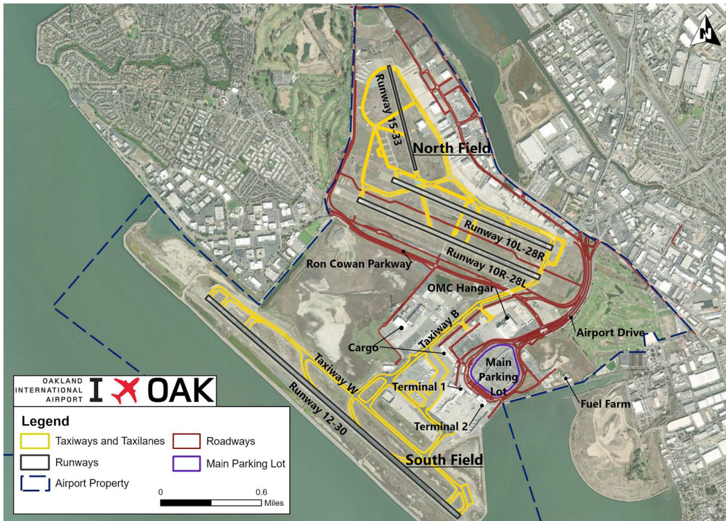
Figure 1 Existing Facilities at OAK

The New Terminal would be an approximately 830,000-square-foot building north of the existing Terminal 1 with a connector building between the existing terminals and the New Terminal. The New Terminal would include additional aircraft gates, holdrooms, concessions, ticketing/check-in, baggage claim, passenger security screening, baggage screening, public restrooms, public circulation, and other support functions.